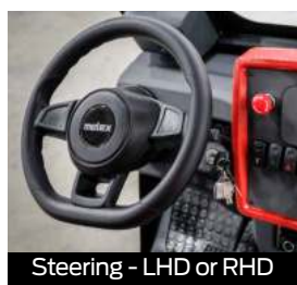
Steering - LHD or RHD