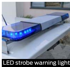
LED strobe warning light