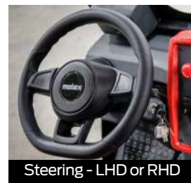
Steering - LHD or RHD