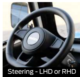
Steering - LHD or RHD