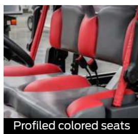
Profiled colored seats