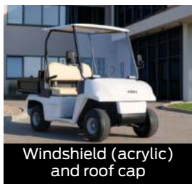
Windshield (acrylic) and roof cap