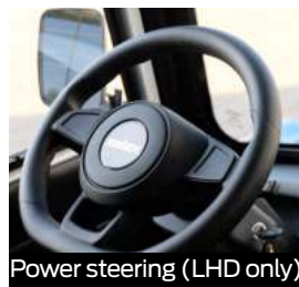
Power steering (LHD only)