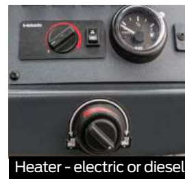
Heater - electric or diesel